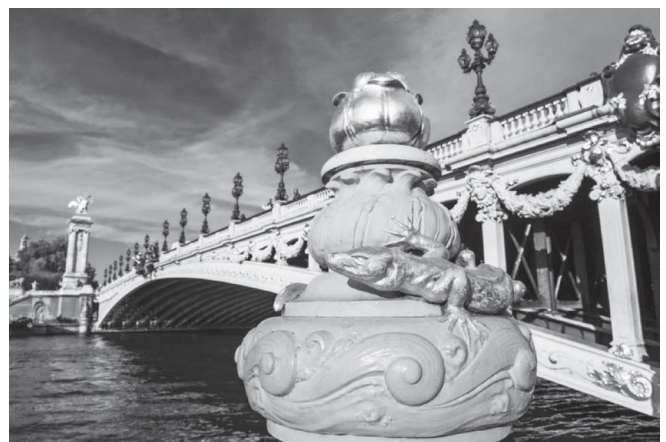
Ex. 1: Le Pont Alexandre III

struck by the ornate statuary and decorative details. (See Example 1.) Below, one is impressed by the beautiful steel work, reminiscent of the Eiffel Tower, completed just ten years before. The music it inspired represents the pomp and splendor of life at