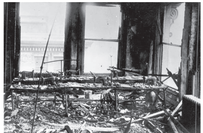
The Triangle Shirtwaist Factory Fire, 1911

recently arrived from Europe. Most of the victims burned to death because the exit doors were locked to prevent worker theft. It was one of the worst industrial accidents in American history. Ten days