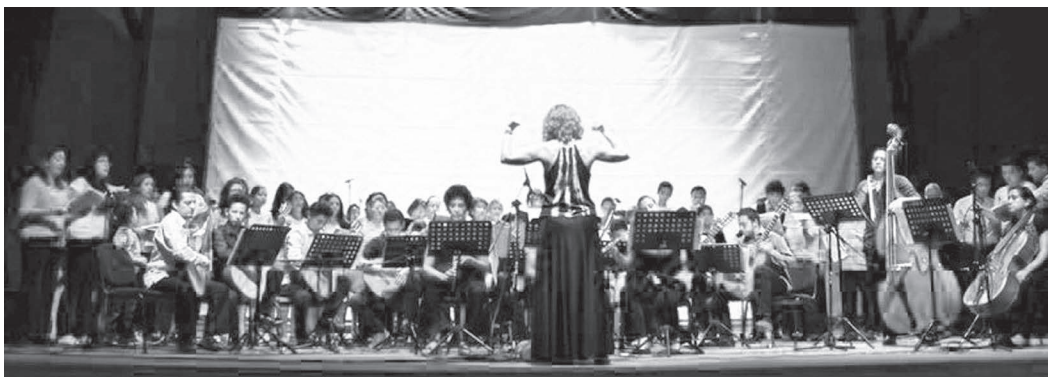
Ex. 3. Concert at the University of El Salvador