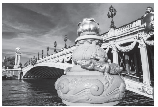
Ex. 1: Le Pont Alexandre III

struck by the ornate statuary and decorative details. (See Example 1.) Below, one is impressed by the beautiful steel work, reminiscent of the Eiffel Tower, completed just ten years before. The music it inspired represents the pomp and splendor of life at