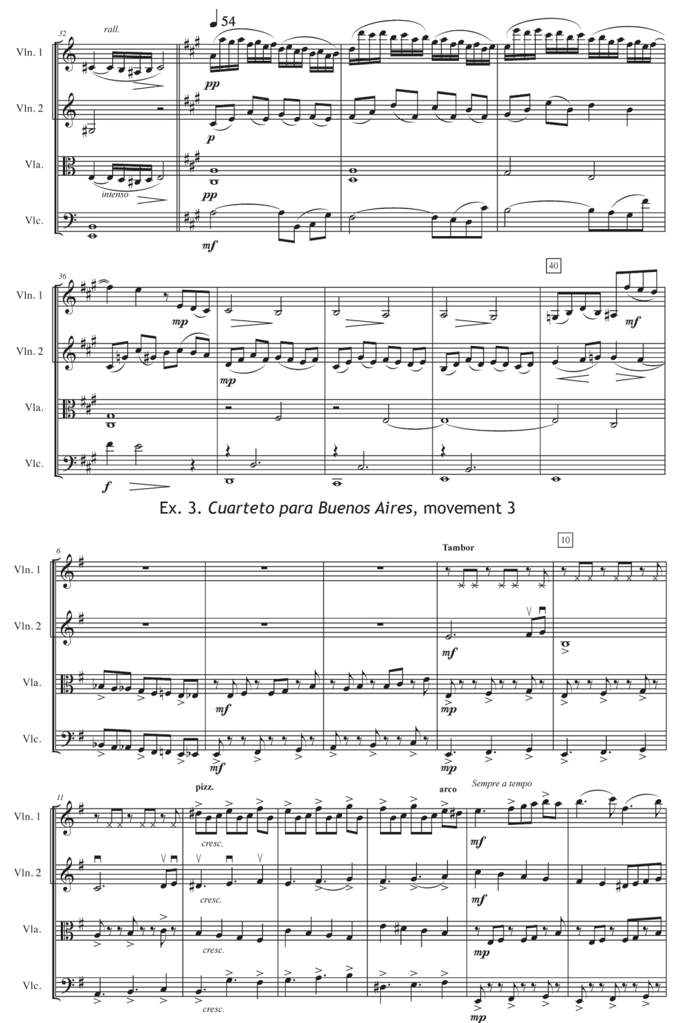
Ex. 4. Cuarteto para Buenos Aires, movement 4

instrumentalists need to learn a different technique and style when playing Argentinian music.) After having achieved so much recognition with this quartet, I sometimes wonder if I will be able to match or surpass its quality in future works. It is a challenge that motivates me to continue composing. To watch the video of scenes from Buenos Aires and listen to excerpts, please visit this link: https://www.youtube. com/watch?v=3Yp_MxRGIdQ