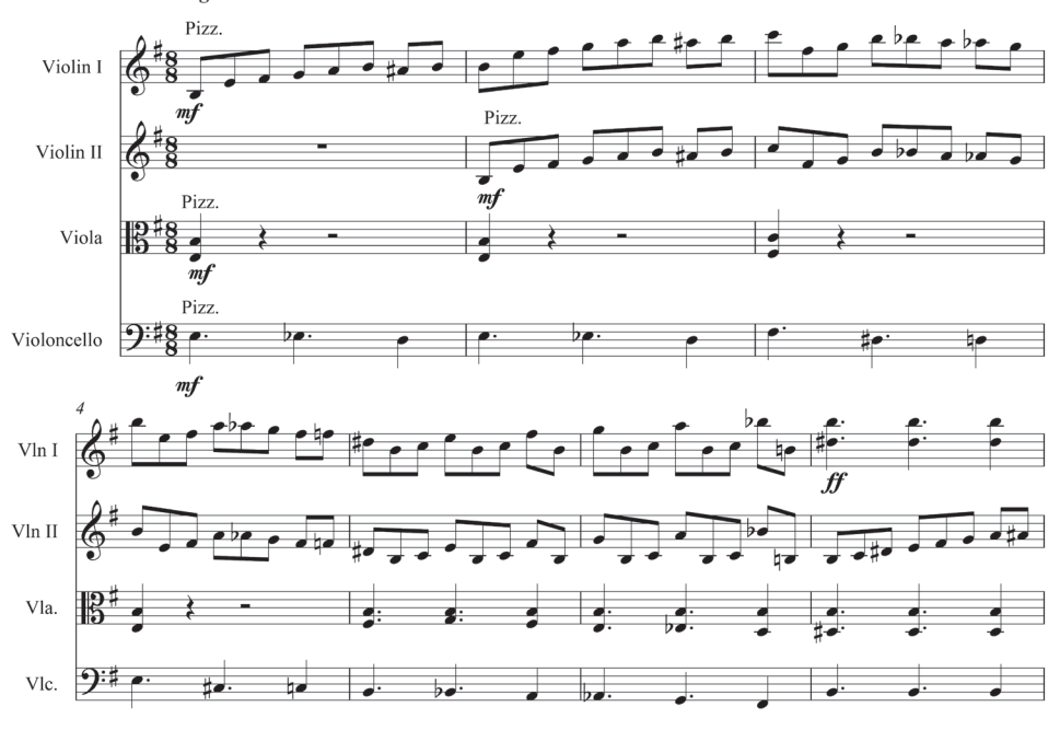
Ex. 2. Cuarteto para Buenos Aires, movement 2

each movement: elaborated, varied, and transformed. The work's duration is seventeen minutes. The first movement, andante espressivo, begins in a fugal style followed by the subject, which is now accompanied by the rhythm of the milonga (3+3+2), a musical genre or dance style related to the Argentine tango. (See Example 1, m. 8.) The contrasting rhythmic patterns alternate in the movement and form a discourse, respecting the hierarchies of each instrument.