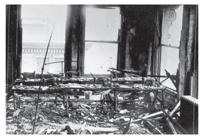
The Triangle Shirtwaist Factory Fire, 1911

recently arrived from Europe. Most of the victims burned to death because the exit doors were locked to prevent worker theft. It was one of the worst industrial accidents in American history. Ten days